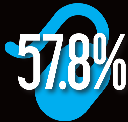
Said that the performance made them want to learn more about PEP (post-exposure prophylaxis)