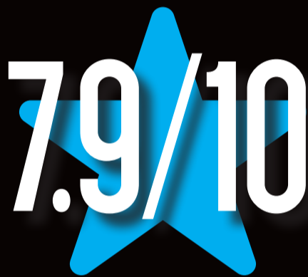
Participants rated the performance quality

Above all, participants relished the interactive nature of the performance and the ability to share personal stories, such as experiences of coming out and feelings of loneliness, in a safe environment. Audience members described the sharing of stories by both the audience and actors as brave, honest, generous, liberating, powerful, engaging, and unlike anything they had seen before. The interaction afforded by the performance fostered a sense of connection between audience members and helped them to feel less isolated and alone in their experiences.