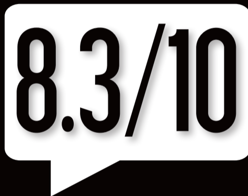
Likelihood of recommending the performance to someone else