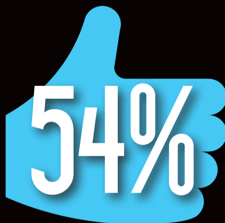
Said that the performance improved their understanding of testing as a way to prevent the transmission of HIV